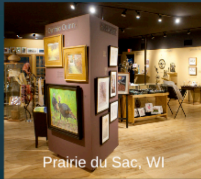
Prairie du Sac, WI